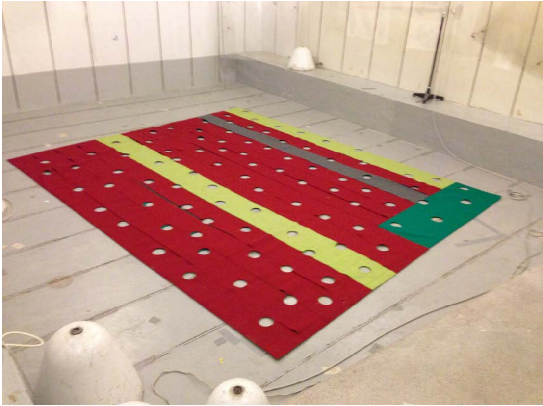
Figure 1 Photo of the mounting of the test specimen in the laboratory.