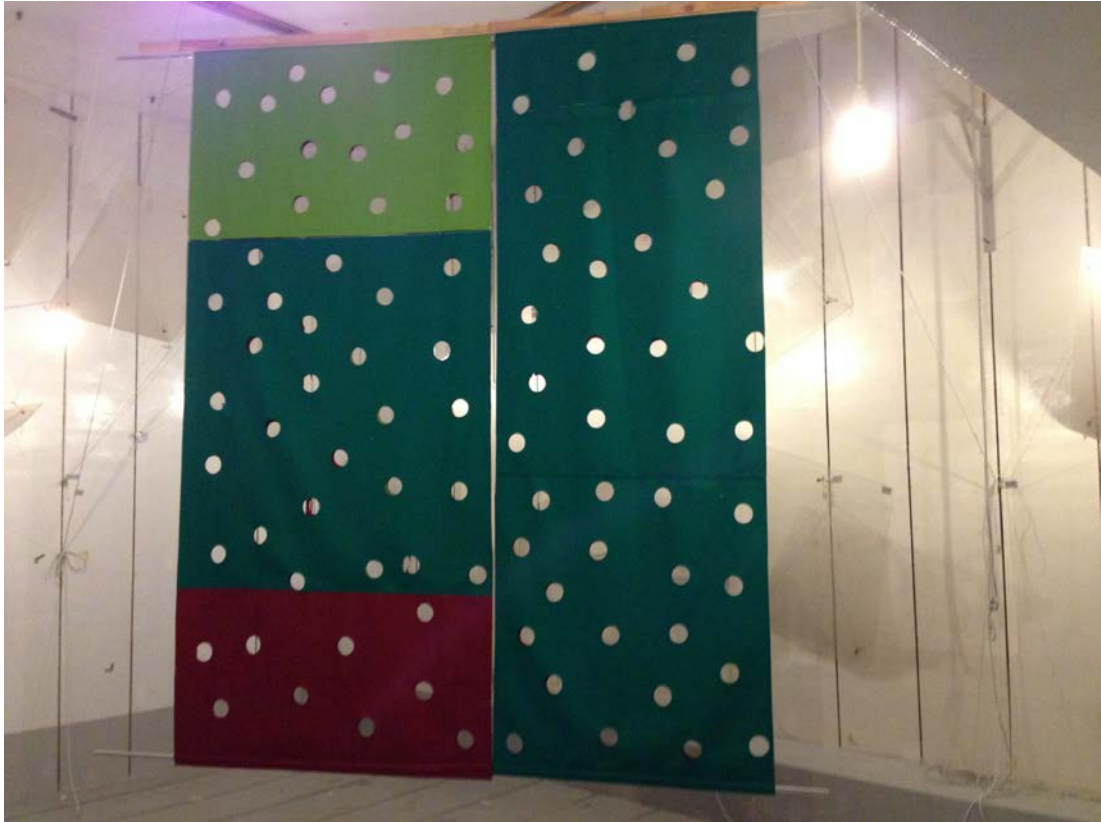
Figure 1 Photo of the mounting of the test specimen in the laboratory.