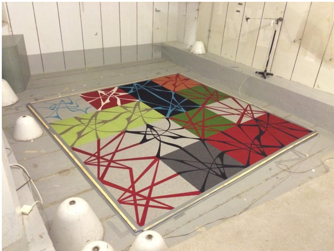
Photo of 15 mm Fraster filt Plus acoustic panels in the reverberation room.